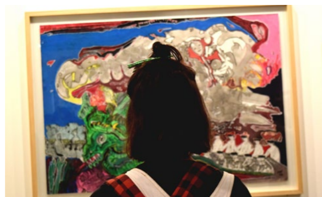
A student looks at a painting at arteBA.