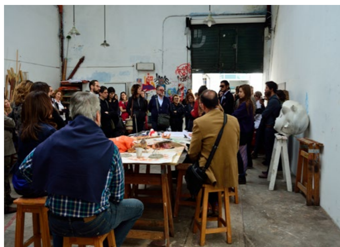
arteBA's VIP guests visit Casa Escuela.

arteBa is the most significant contemporary art event in the region, and continues to gain importance at an international level. We're proud to form part of their programming and hope to work with them more in the coming years.