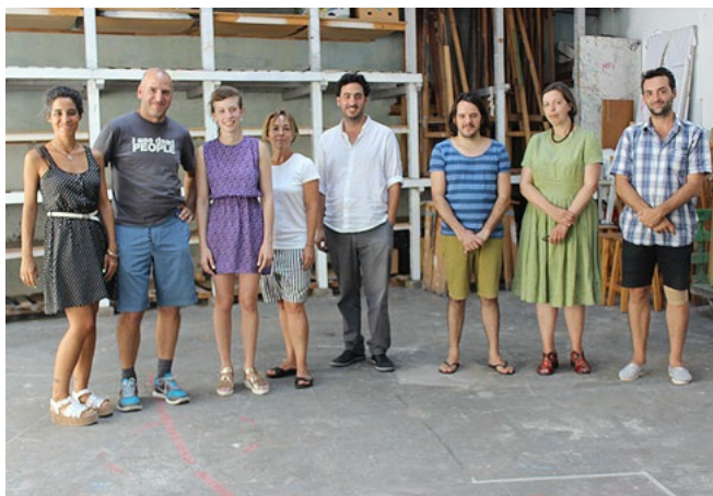
The 2015-2016 Education Program faculty.