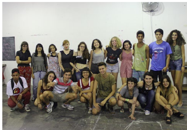
Students on their first day of classes.